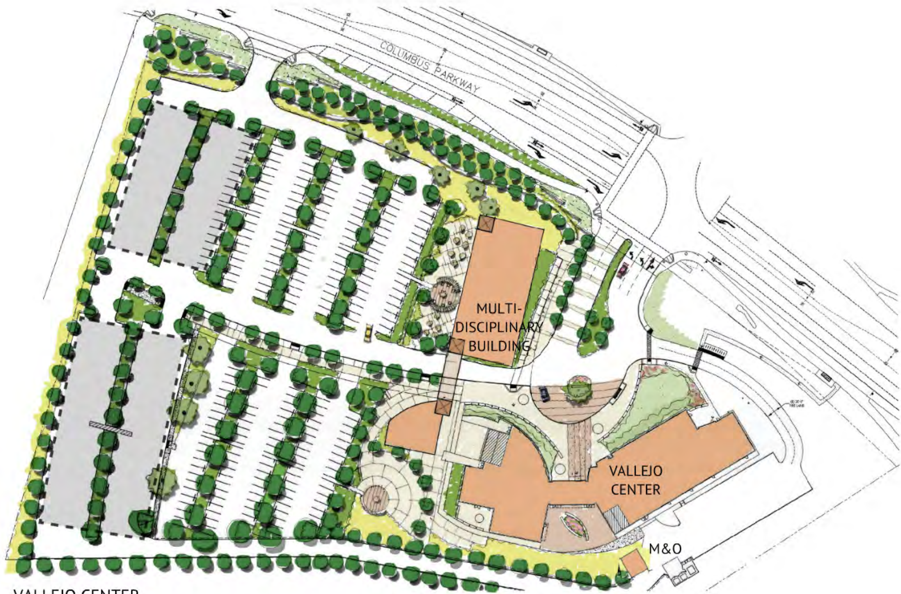
VALLEJO CENTER FINAL DRAFT CAMPUS PLAN